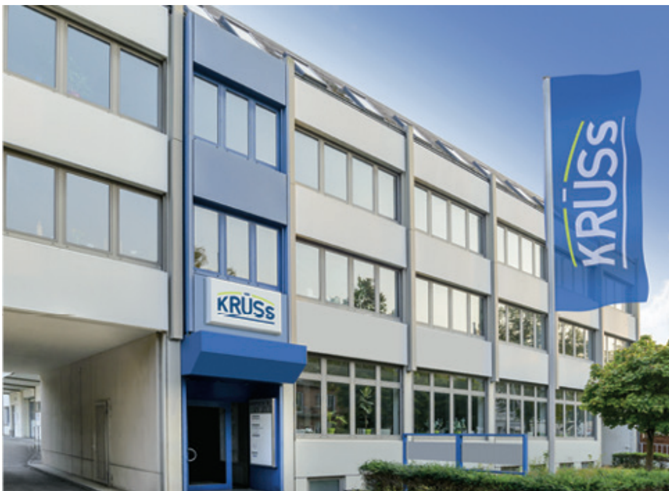
A.KRÜSS Optronic Headquarters in Hamburg

A.KRÜSS Optronic is a leading manufacturer of high-precision laboratory and analysis instruments. For more than 200 years we have been developing and manufacturing innovative product solutions for the quality control of raw materials, semi-finished products and end products in Germany.